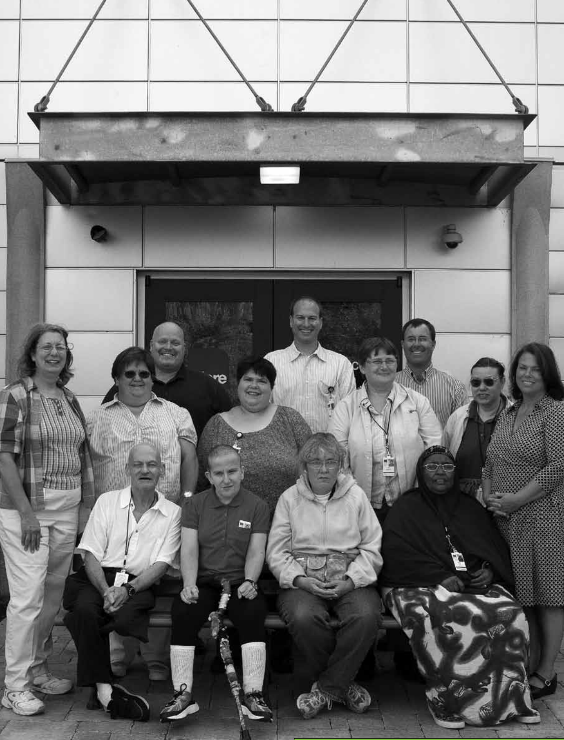
The Goodwill team with leadership of Alere Scarborough, Inc.